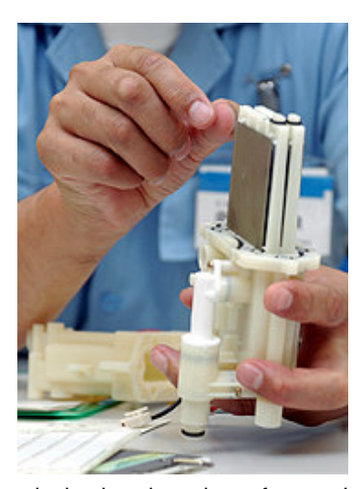
Electrolysis chamber plates from a Jupiter water ionizer not even the size of a playing card