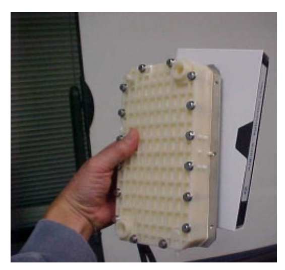
Electrolysis chamber from an Enagic water ionizer as compared to a standard VHS tape